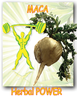
MACA Root Powder

Tribulus Terrestris has 6 substances which have proven by scientific studies to increase testosterone levels. These substances, such as Protodioscin, have shown the positive effect of increasing libido.